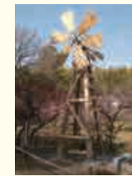
Windmill from Sakai Osaka

You can view old houses from all over Japan in one place.