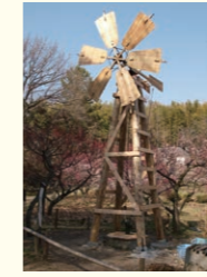
Windmill from Sakai Osaka

In the Edo period, Osaka was known as a center of commerce in Japan and many granaries owned by feudal lords lined the banks of the Dojima River.