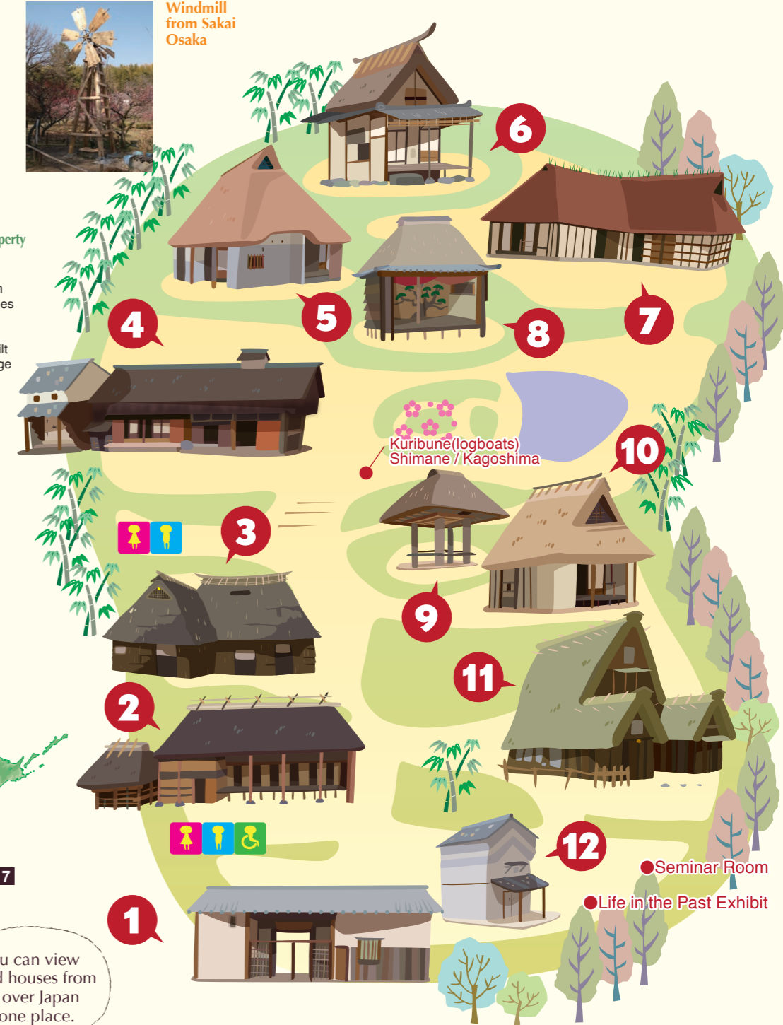
Kuribune (logboats) Shimane / Kagoshima